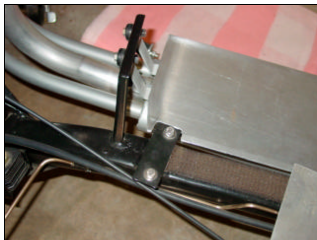
Webbing on driver's side frame rail butts up to the left rear body mount. 1/16" inch rubber pad on body mount is flush and level with 1/8" frame webbing.

By now, you should have installed your frame webbing and rubber pads on top of the frame. Make sure that your rubber pads are 1/16" thick and your webbing 1/8" thick so everything ends up on the same plane and you don't warp your floor pan when you bolt it down. The body mounting brackets that get the rubber pads are raised about 1/16" above the frame. That's why the difference in thickness between the webbing and the rubber pads.